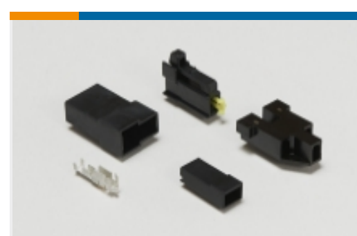
Magnet Wire Terminals(1)